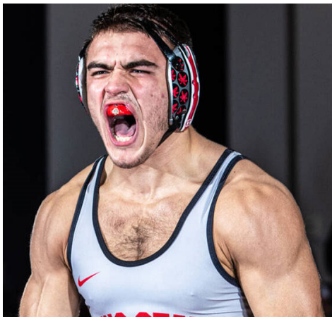
Smith after big home dual win vs Cornell